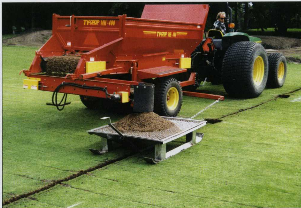
Backfilling trench with buckshot stone.

In a separate operation, the trenches are backfilled with buckshot stone to within 3 inches of the surface, then topped with a sand mix. Then, the whole area is top-dressed with 40 tons per acre of sand, about an eighth of an inch thick, using a ty-crop spreader.