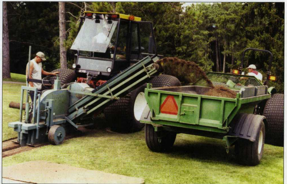
FAST AND QUICK. The Shelton Super Trencher cuts a trench up to 5" wide and conveys it away to the removal cart.

Until recently, the only cure for poor drainage has been major reconstruction of fairways and greens using conventional drainage methods that involve trenching, re-establishment of