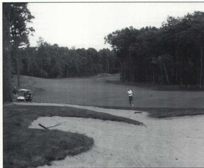
THE LEGACY COURSE AT CRAGUN'S was in prime shape for the 2002 MGCSA Championship. It was a terrific day to play golf up in the Northland.