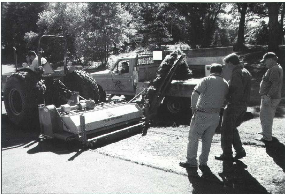
The Koro Topmaker removes the old sod.

Last spring the Green Committee began to pursue the conversion of the abandoned fairways from the crazy mix