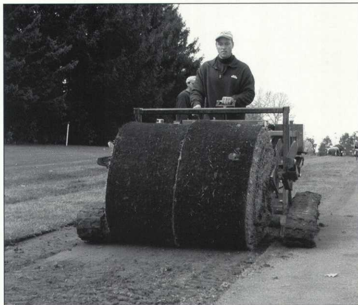
Rolling out the new sod.

The once huge and straight fairways were modified and narrowed into hourglass shapes which offered tight targets for the long hitters and large landing zones for those willing to take a lesser risk. Great idea for some clubs, but it became very evident after a short period of time that the narrow necks were also the landing zones for the second, and even third and fourth shots of those unable to reach the green in regulation. And what once was a blend of Poa, bent, blue and rye grass fairway, maintainable fairly consistently at a tad over one half inch, became spotty, marginally-playable and aesthetically unacceptable rough. Scratch