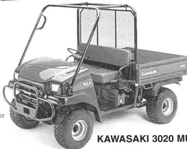
KAWASAKI 3020 MULE™