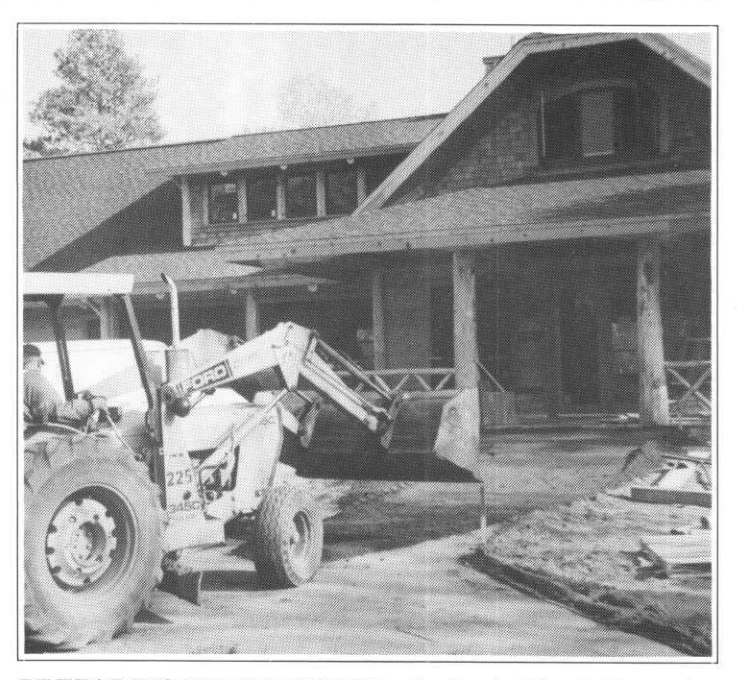
PREPARING THE WALKWAY to the front of the clubhouse before the application of asphalt, a workman smooths the path with his front-end loader.