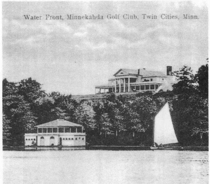
From 1900 to 1906, Minikahda members traveled by boat from the foot of Lake Street to this boathouse on the west shore of Lake Calhoun. From this point they had a long, steep climb to the clubhouse.