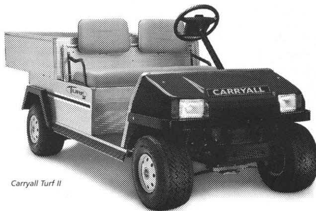
Carryall Turf II

Our new Turf II is loaded with a great package of standard features. All of which makes a great vehicle an even greater value. Turf II is part of Carryall's complete line of versatile, dependable vehicles. To find out more, call or drop by your nearest authorized Carryall dealer.