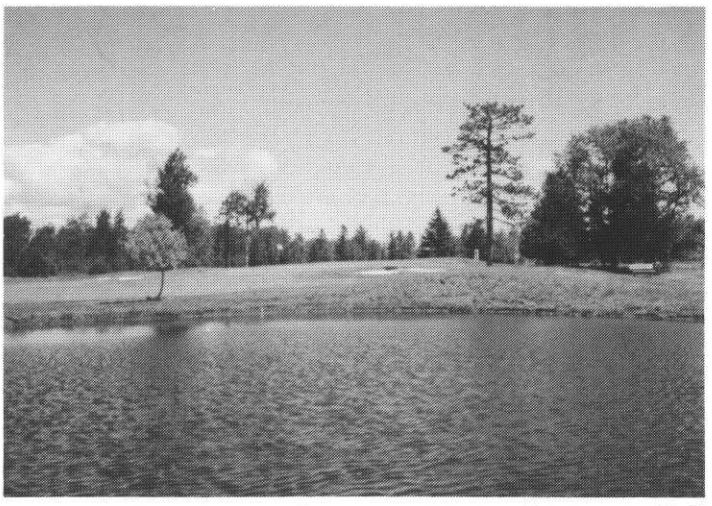
Nemadji's Par 3 course features water, sand traps and all other hazards encountered on a regulation-sized course.

Nemadji realizes that junior golfers are the future of golf. The fine tradition of honesty, integrity and pride that has been a trademark of the game of golf can only be continued if the young golfers of today are properly educated in etiquette, swing basics and on and off-course behavior. Nemadji Golf Course is dedicated to providing area juniors with all of the available opportunities that will help them increase their skill and their appreciation of the game of golf. At the beginning of the summer there are two junior clin-(Continued on Page 15)