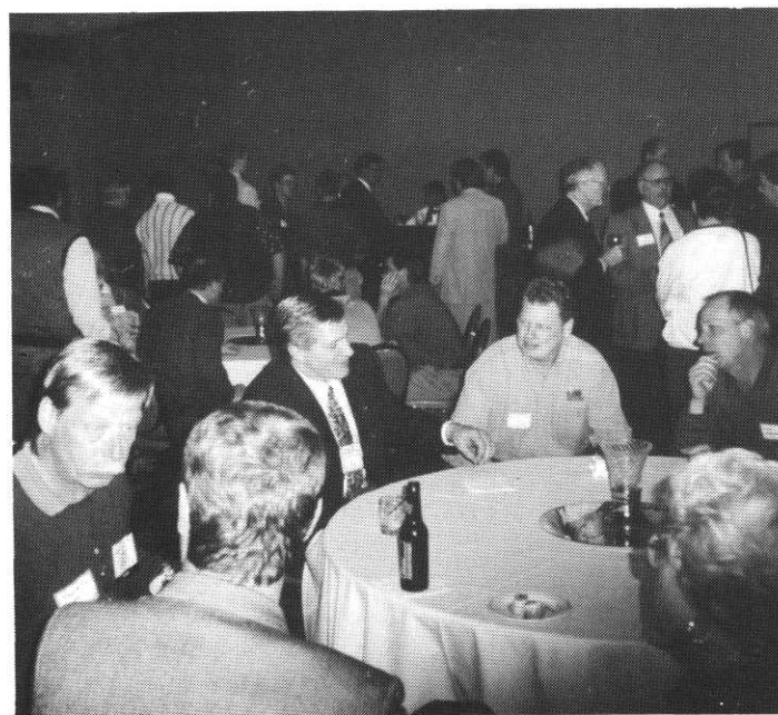
MGCSA Hospitality Night in Anaheim attracted 140 members to the festive occasion in California at the National Convention.