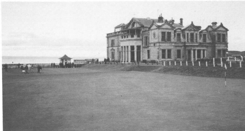
The 18th green, first tee and clubhouse on the Old Course.