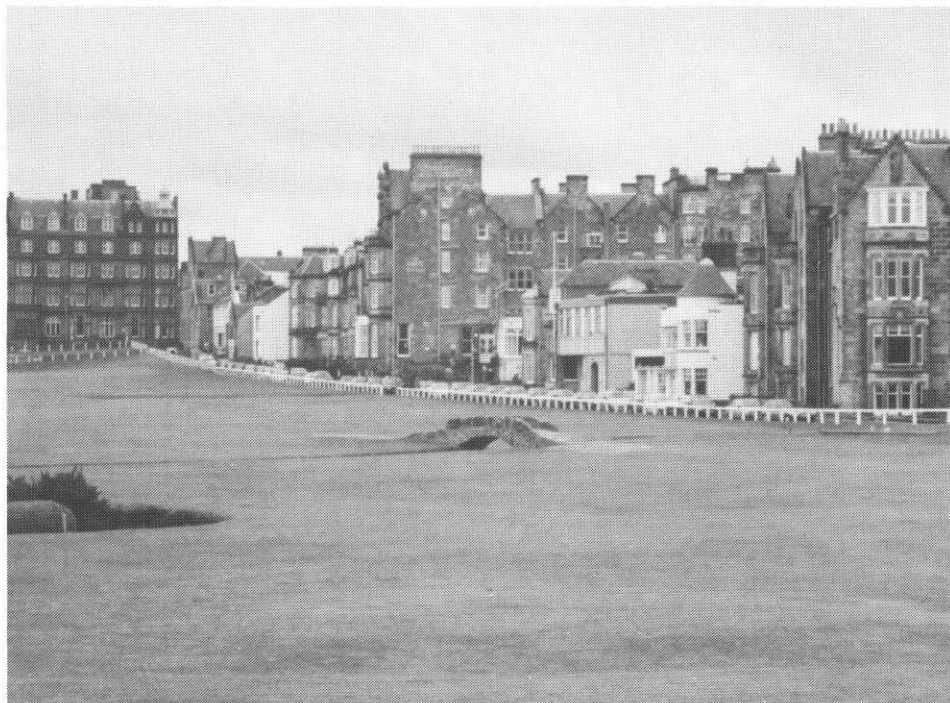
The Old Stone Bridge, looking up 18 fairway.