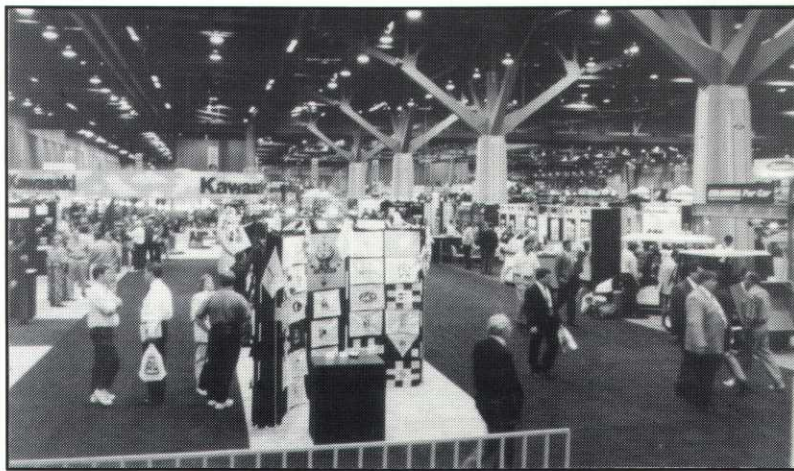
Trade Show Floor at the Las Vegas Convention Center.

Look for pictures throughout this issue from the GCSAA national convention held in Las Vegas in early February. More than 200 members and spouses attended the many seminars, events and trade show. The weather was great while we were there with temperatures in the 60s and even low 70s one day. It was just