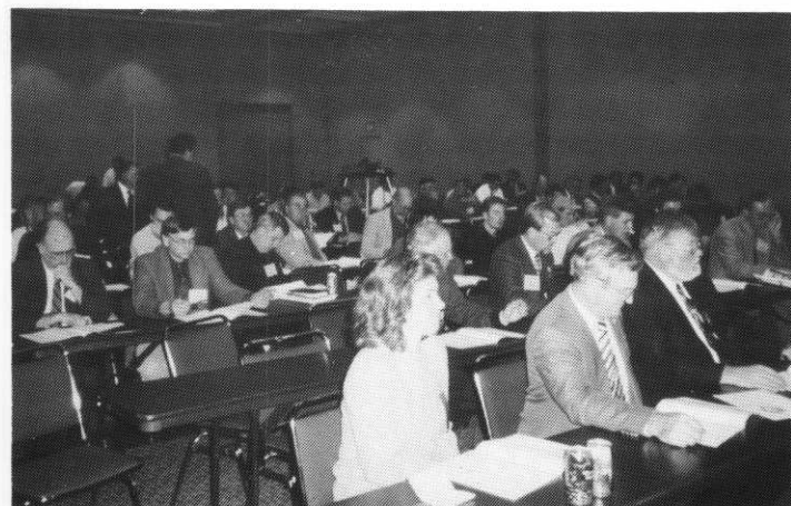
The MGCSA's 70th Annual Business Meeting.