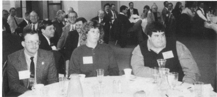
MGCSA AWARDS LUNCHEON