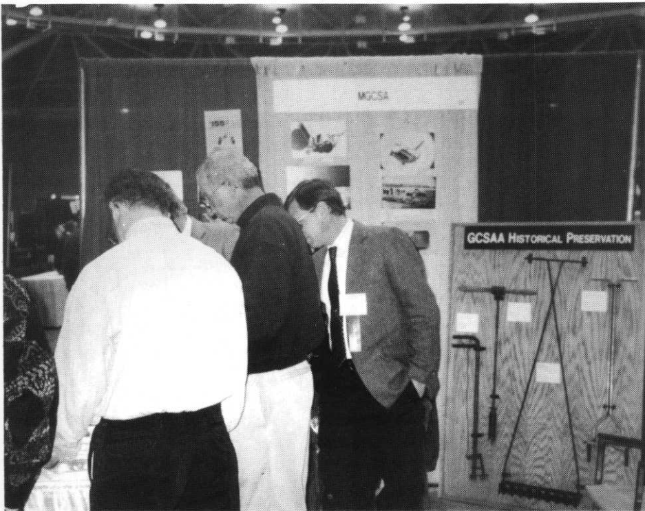
THE MGCSA BOOTH at the 1997 MTGF Conference & Trade Show had a display of old maintenance equipment from the GCSAA Historical Preservation.

HOSPITALITY NIGHT AT NATIONAL TAKES PLACE FEBRUARY 6 AT THE WESTCOAST ANAHEIM HOTEL 6:00-10:00 P.M. HORS D'OEUVRES AND CASH BAR PROVIDED