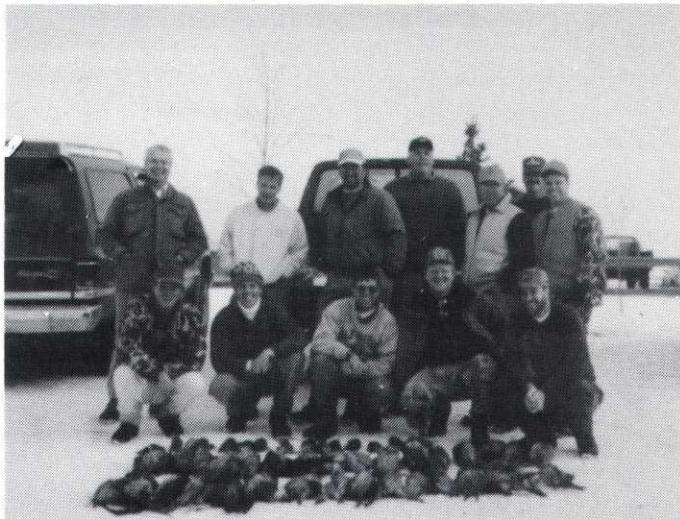
Members of the MGCSA enjoyed a successful hunt in Southern Minnesota last November.