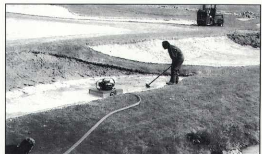
4 Minutes Later...