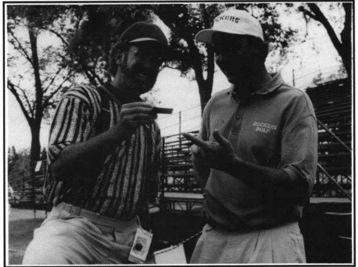
THE AMAZING HONDO amazed host Tom Lehman.

As the day went on, Payne Stewart decided to become a part-time cameraman for MSC, Peter Jacobsen did his best imitation of fellow competitors and a few other tour favorites. Eventually Tom Kite won the golfing event while the Children's Cancer Fund wound up being the real winner.