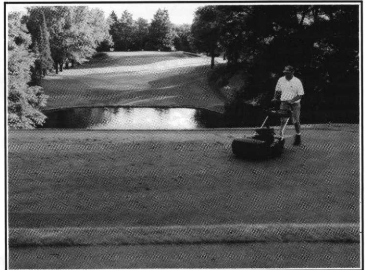
GROOMING the infamous Tenth Hole at Minneapolis GC.