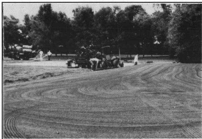
Putting finish grade on the tee.

The entire construction project began in July right after the Western Junior Open and finished according to schedule. Next year after the snows of winter have cleared, and Mother Nature awakens the earth, you will find a new golf course emerging from dormancy.