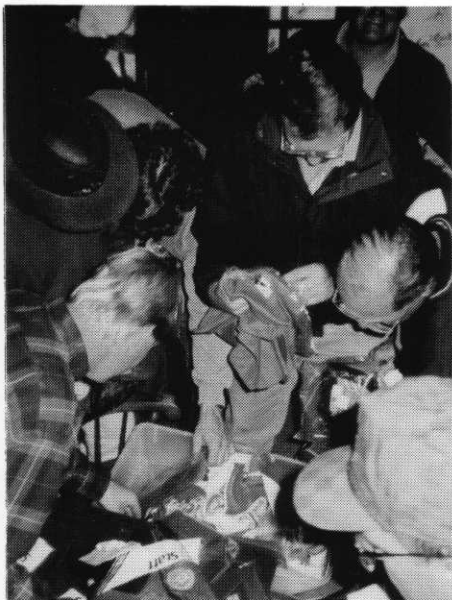
WINNERS of the October Mixer at Fox Hollow scramble to pick out prizes.