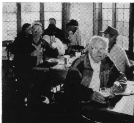
RELAXING after the round.

NATIONAL is a registered trademark of National Mower Company