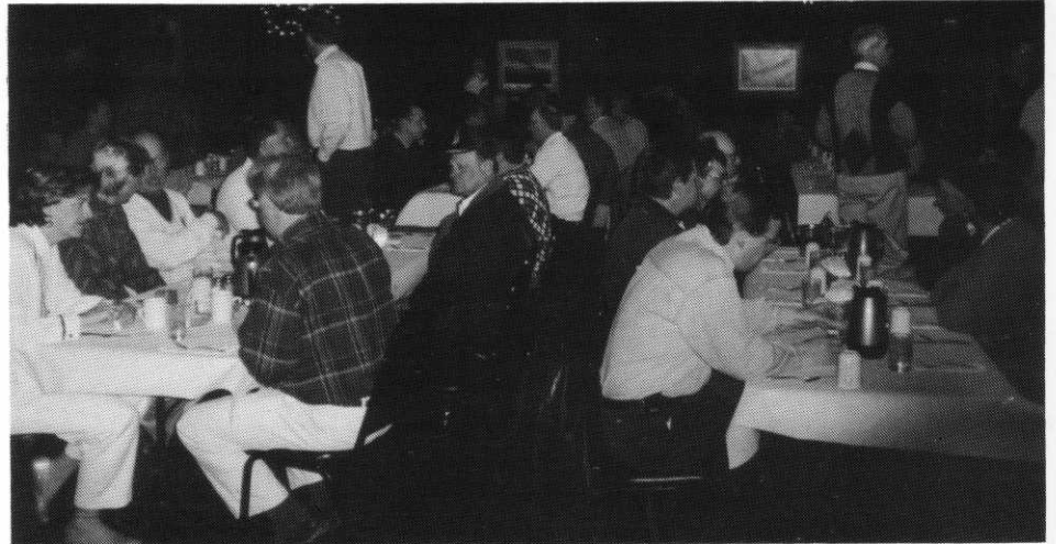
APRIL MEETING attendees enjoyed a nice lunch at Southern Hills.