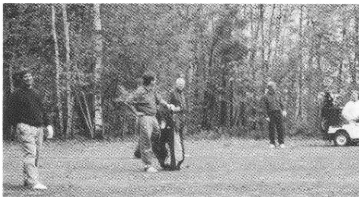
Representatives of North Star Turf Co. playing Chisago Lakes.