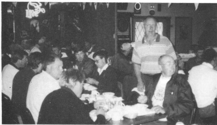
MGCSA members enjoying the lunch.