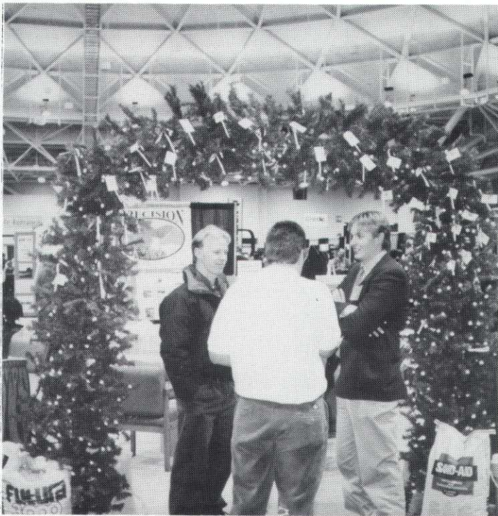
REPRESENTATIVES FROM PRECISION TURF greeted attendees at this year's MTGF Conference and Show at the Minneapolis Convention Center.