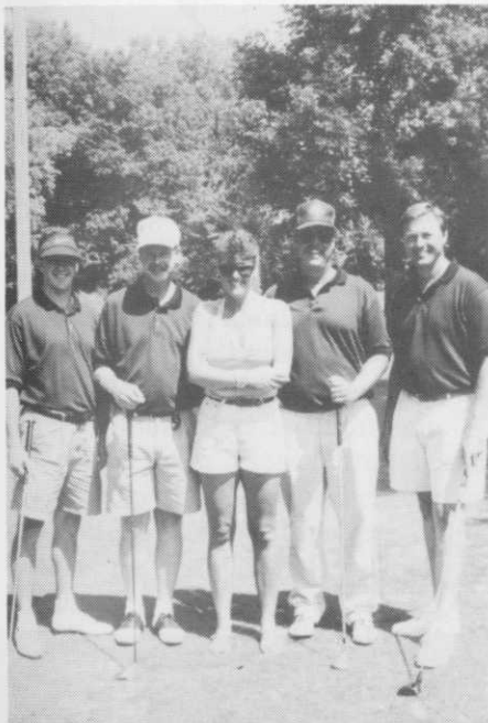
TEAM GARSKE — What is this five-some?