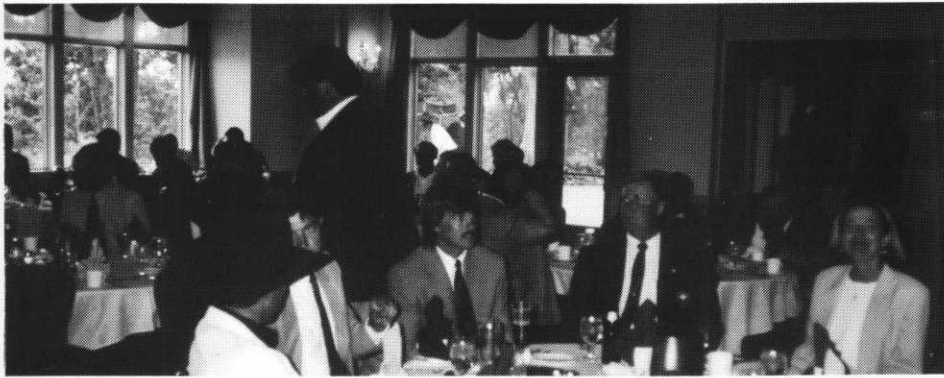
Thanks to Wayzata CC for a nice dinner at the MGCSA Championship