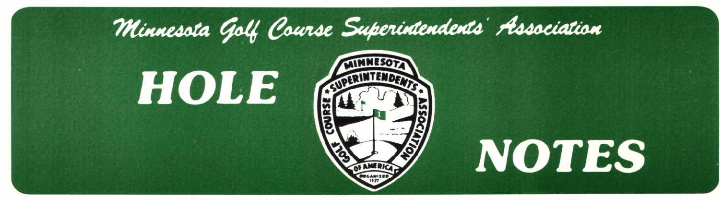
AFFILIATED WITH GOLF COURSE SUPERINTENDENTS ASSN. OF AMERICA