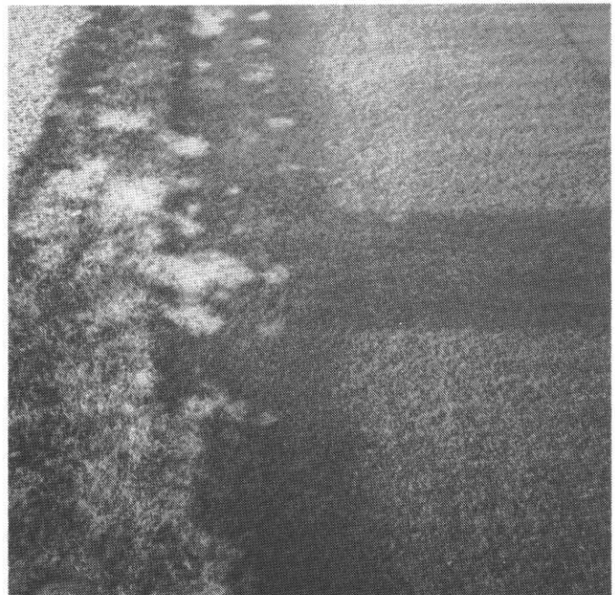
Treated vs. untreated. Lakewood Golf Club in Oscoda, Mich., April 1990.

Confidence in the tank mix of CHIPCO® 26019 + Daconil 2787® for snow mold control has been proven with over a decade of research data from turfgrass pathologists at Michigan State, Rutgers, University of Massachusetts and other universities.