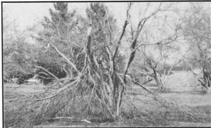
FARIBAULT GOLF & COUNTRY CLUB Freezing rain caused damage to Amur Maple Trees.