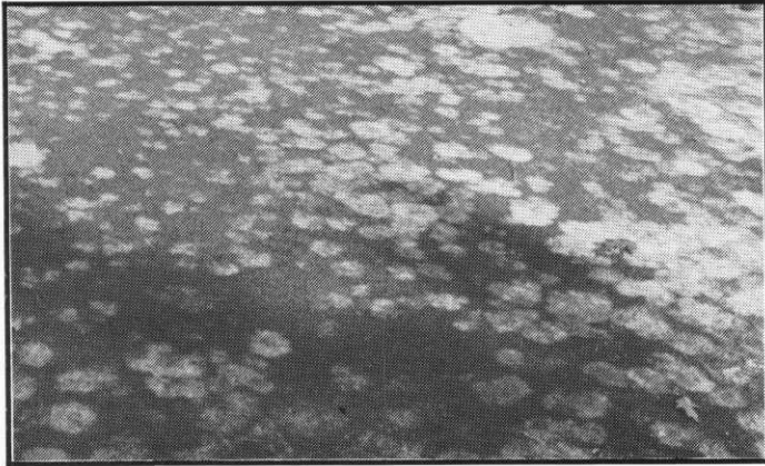
Nothing was applied at the sod nursery at Braemar G.C.

Spring has arrived, the turf is starting to grow and we are seeing some unsettling sights. Reports are coming in from all over the state, of tan turf, where there should be green. What caused the tan patches? I'll leave the official explanation up to the experts; on my golf course I have seen where the ice just sat a little too long, some crown hydration, maybe even some low temperature kill. Superintendents throughout the state are starting to put to use their collective talents and skills to bring back to life putting surfaces that are scarred, fairways that are barren and tees that have no turf to be seen anywhere.