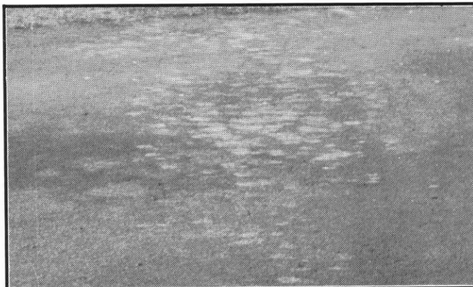
BRAEMAR GOLF COURSE Plant protectants applied to the right and left of this slice.