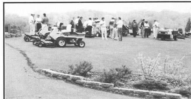
Cushman Motor Co. and E.S. Dygert Co. displayed some of their equipment.