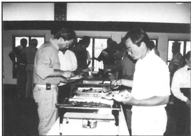
Great lunch put on by Braemar G.C.