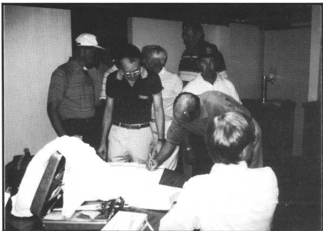
Checking in at Registration.