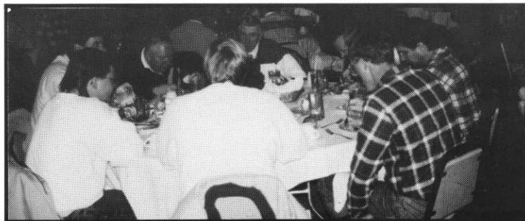
THE GATHERING WAS GREAT!