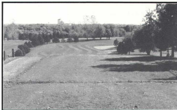
First Hole At Hastings Country Club