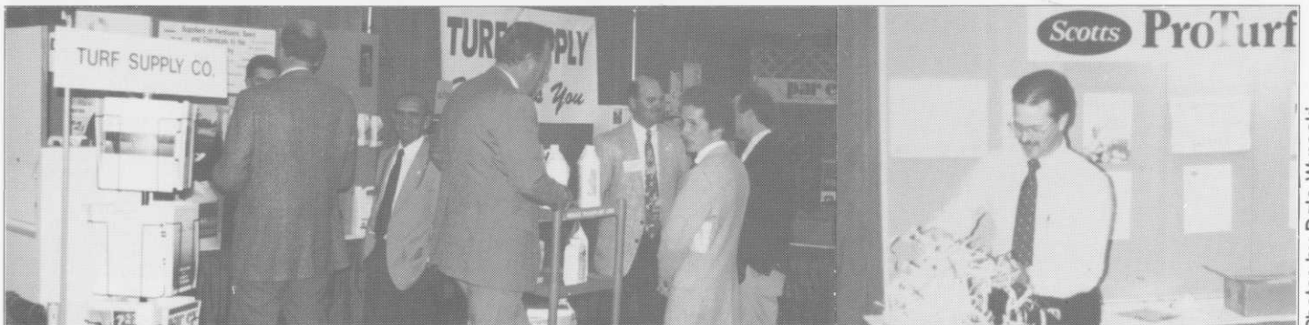
TURF SUPPLY — like all the booths at the trade show — was a busy place.