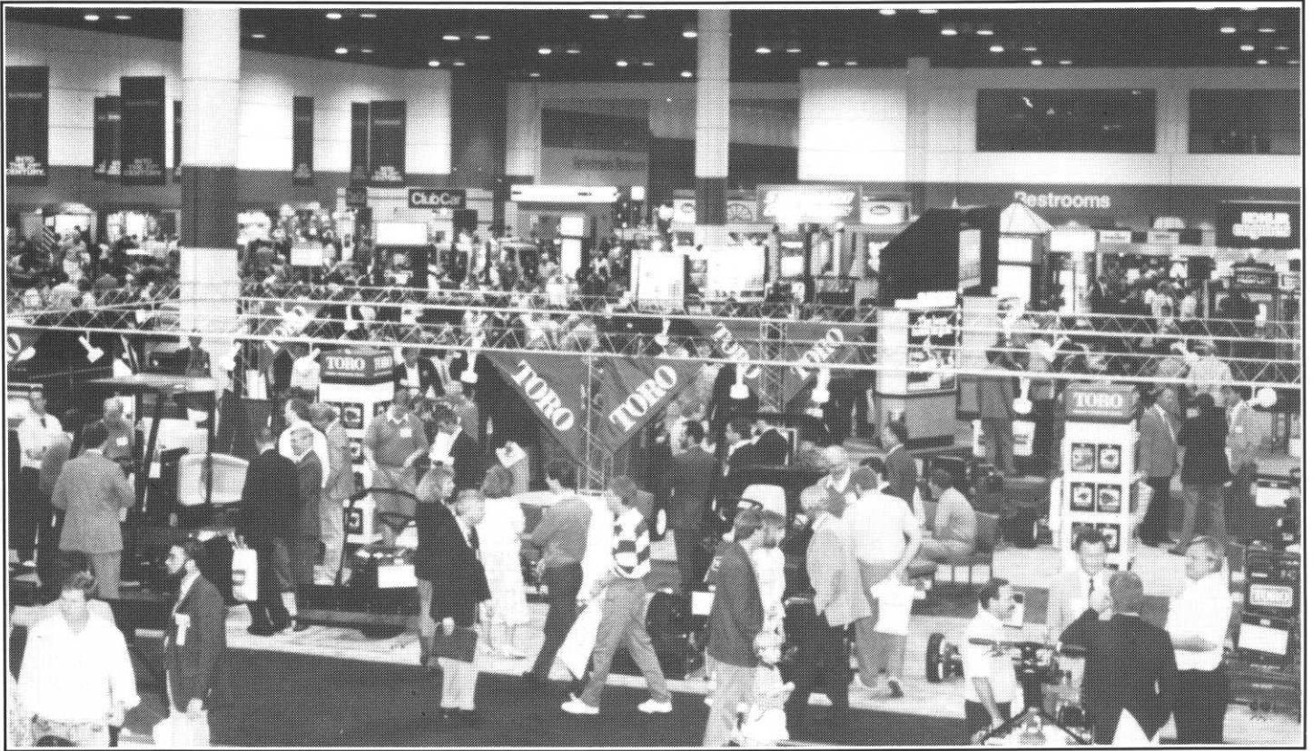
Huge Crowds Jammed the Exhibit Area at the 1990 GCSAA Conference