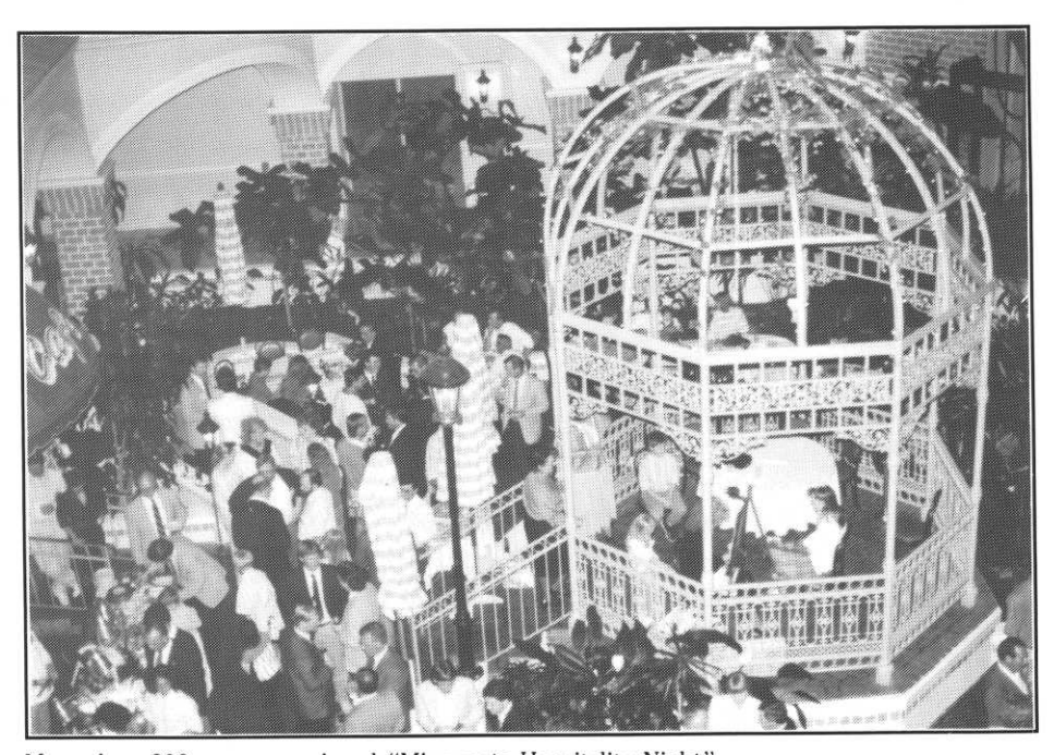
More than 200 persons enjoyed "Minnesota Hospitality Night."

The 1991 GCSAA Golf Championship will be held Feb. 4-5, in Scottsdale, Ariz.