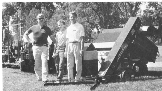
Cushman's sales staff showed off their new Core Processor and other equipment.