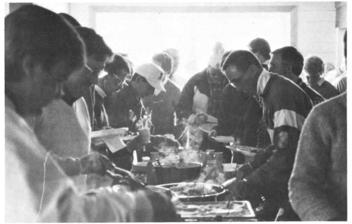
GETTING DOWN TO BUSINESS- All you need to know about Employees Right To Eat Law.