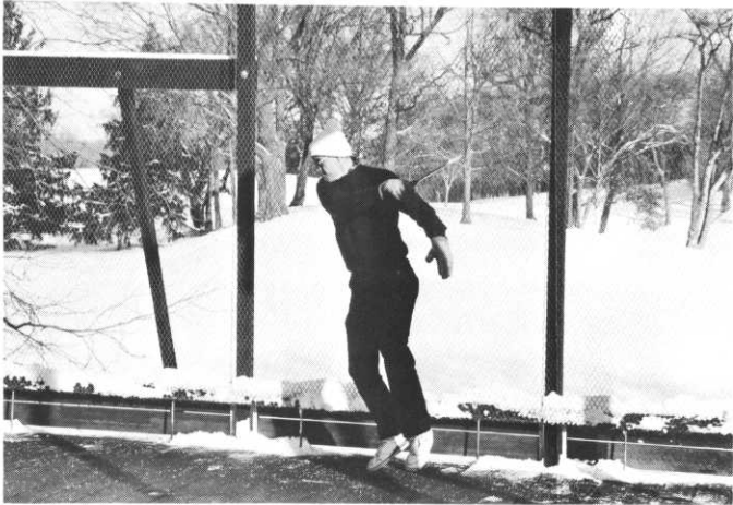
FOREARM SHIVER- The inimitable Taj Mahal delivers a frosty return of serve.