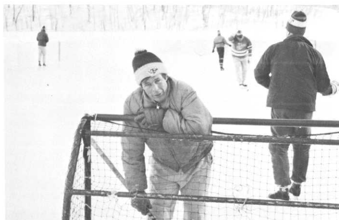
IS THERE A DOCTOR IN THE HOUSE?- "I'd rather face my green committee than go through this again."