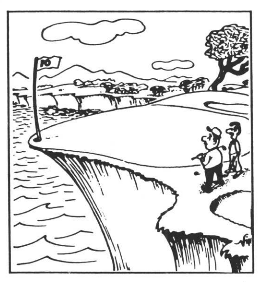
"I told you this was a tough hole."

The superintendents that have held meetings in the past should all receive a pat on the back for submitting their courses to so many critical eyes. Those that would like to host meetings in the future can use the opportunity to collect many suggestions and ideas for future reference.