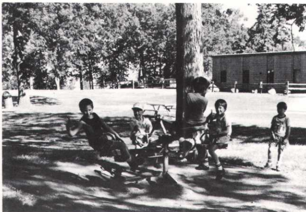
SEE YOU AT THE MOVIES. According to these future supers the annual picnic gets two thumbs up.