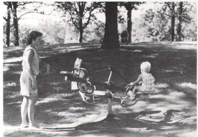
DIZZYING EXPERIENCE. Round and round they go. Where they stop only Mom knows.