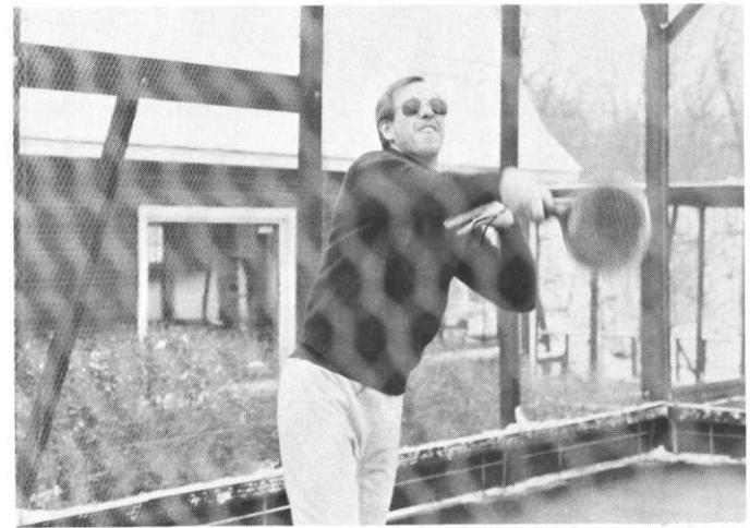
VEXED OFFICIO. Taj Mahal sends one into the nickel seats.