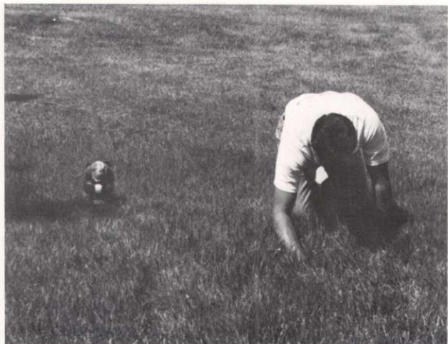
GOLFING GOPHER. That well known Somerset rough makes ball finding difficult.