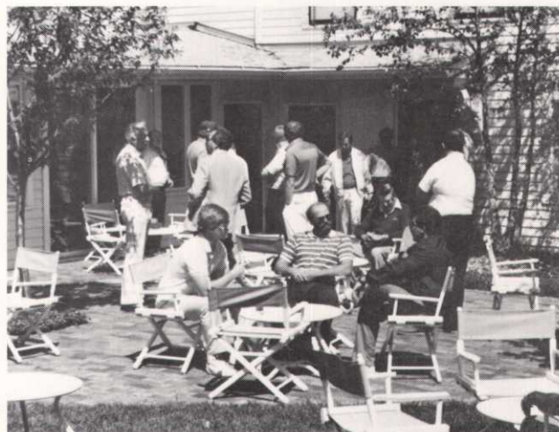
RAY-O-THON. Prior to tee off the sun beckoned players out of doors.