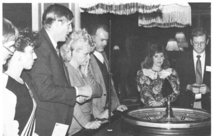
Casino Night was a huge success although no one pictured here appeared to have the winning number.