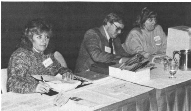
ENTER AND SIGN IN PLEASE - Computerized registration and name tags got us off to a fast start.