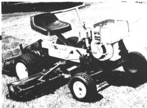
POWER QUINT II: PTO Driven 5-Gang. Highly maneuverable. Cutting units are interchangeable with, and the same as those made for Model 84 for over 30 years. Cuts an 11 1/2-foot swath.