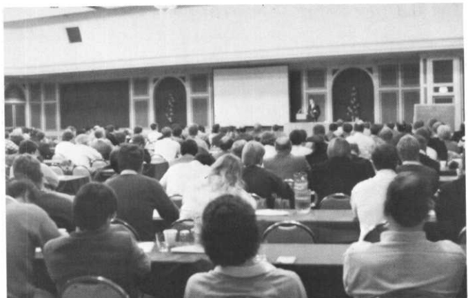
The Big Picture - New facilities at Radisson St. Paul offered comfort and style as well as function.