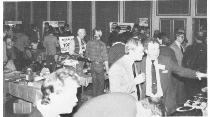
Expanded Bull Session Proved to be a GREAT ADDITION.