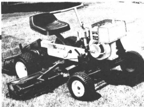
POWER QUINT II: PTO Driven 5-Gang. Highly maneuverable. Cutting units are interchangeable with, and the same as those made for Model 84 for over 30 years. Cuts an 11½-foot swath.