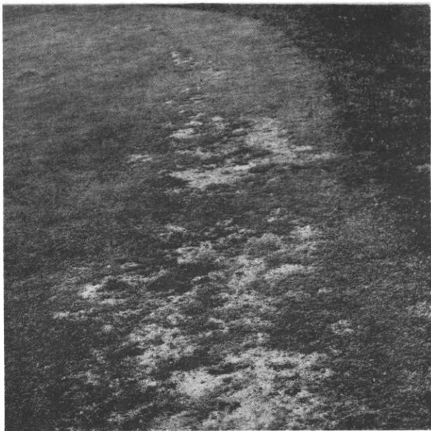
FRIT FLY DAMAGE TO GREEN