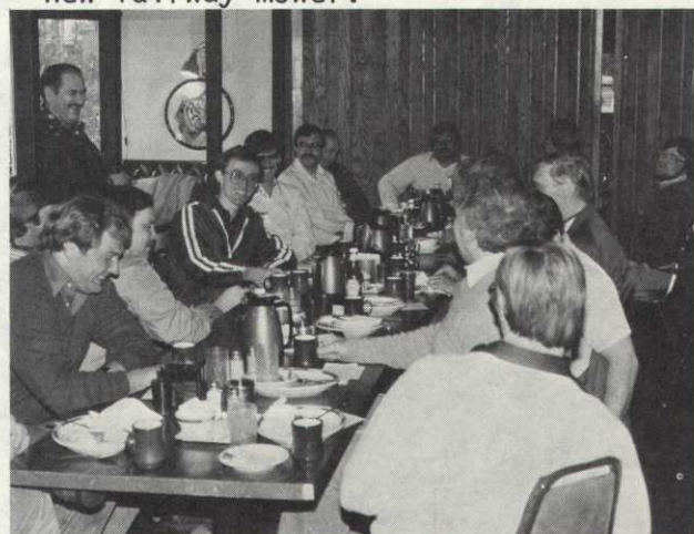
CAUCUS. Minnesota delegates meet to discuss some very serious issues.