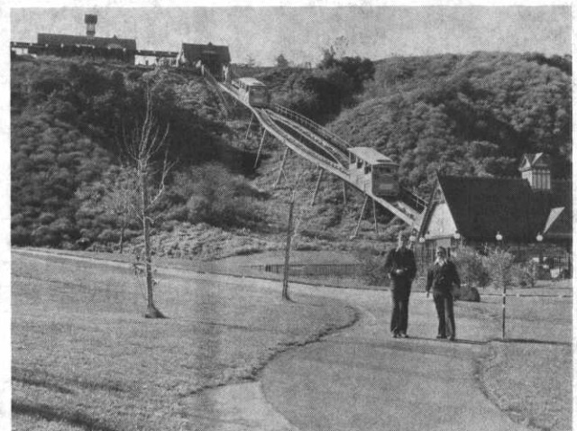
UPLIFT. Kisch and Nylund pose in front of ingenious way to change nines at Industry Hills.