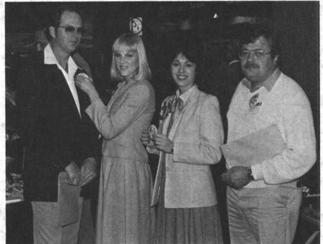
WELCOME. Some booths and devious methods to attract customers.