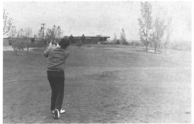
DIFFICULT. The Par 3 ninth yields many bogies and few birdies.