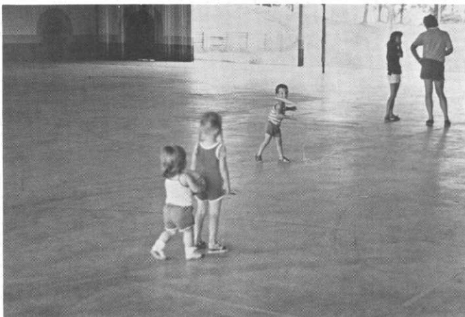
ACTIVITIES. Kids found the large enclosure just right for frisbee flying.