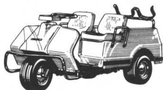
3 Wheel Gas or Electric. The Top Performers

Mixing oil with gasoline GUARANTEES PROPER LUBRICATION!