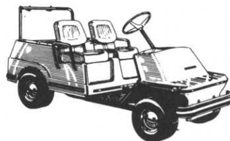
4 Wheel Gas. The Ultimate in Luxury and Performance