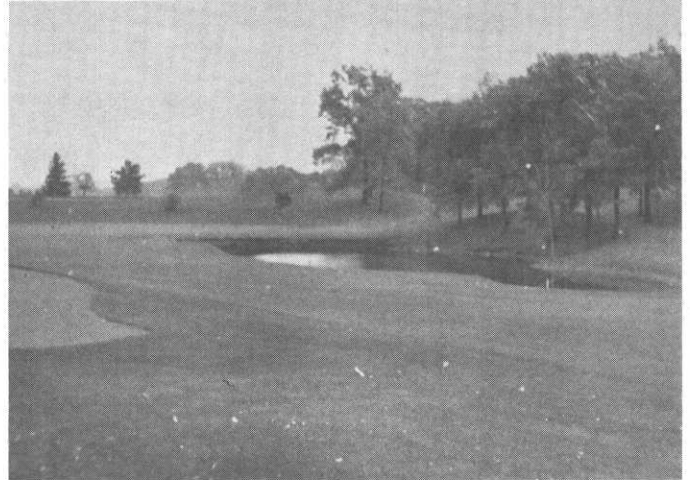
Challenging. Pond at right front of famous 10th Green waits for more golf balls.

Call US for the best in Turf Equipment, The KROMER CO 612/472-4167