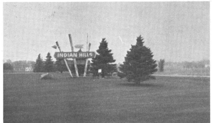
Novel. Sign in front of clubhouse is in perfect harmony with club's motif.

3455 County Road 44, Mound, Mn. 55364 TELEPHONE 612-472-4167