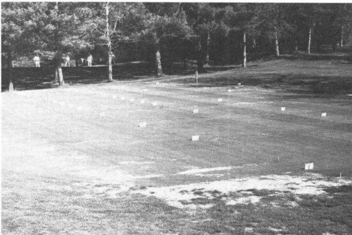
OVERALL VIEW. Rochester Turf Plot was located behind third green in background.