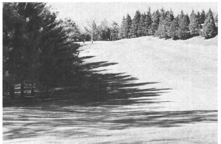
TIGHT. Narrow pine-lined fairways are normal for all holes at Rochester C.C.