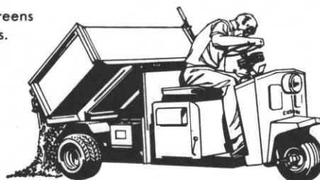
DUMPING/HAULING 1000 lb. payloads. Manual and hydraulic dumping.