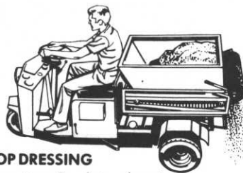
TOP DRESSING Mounts on Truckster chassis. No need for separate engine.

Purchase one of the basic Cushman Turf-Truckster vehicles available in 3 or 4 wheel models with 12 or 18 hp. Then add as many of the new modular accessories as you need for the work you have to be done. No need to buy another expensive vehicle. In minutes you can attach the module you need by using simple pins that slide in and out. No need for tools.