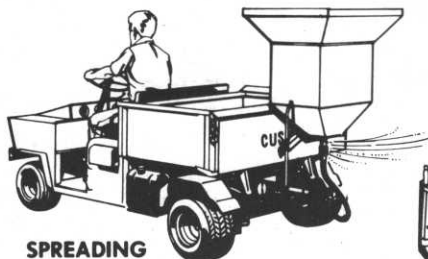
SPREADING Spread up to 40' swath.