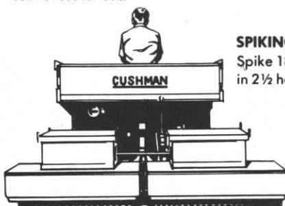
SPIKING Spike 18 greens in 2½ hours.